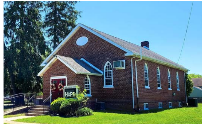
Mt. Salem U.A.M.E. Church met its 190th anniversary in 2025.